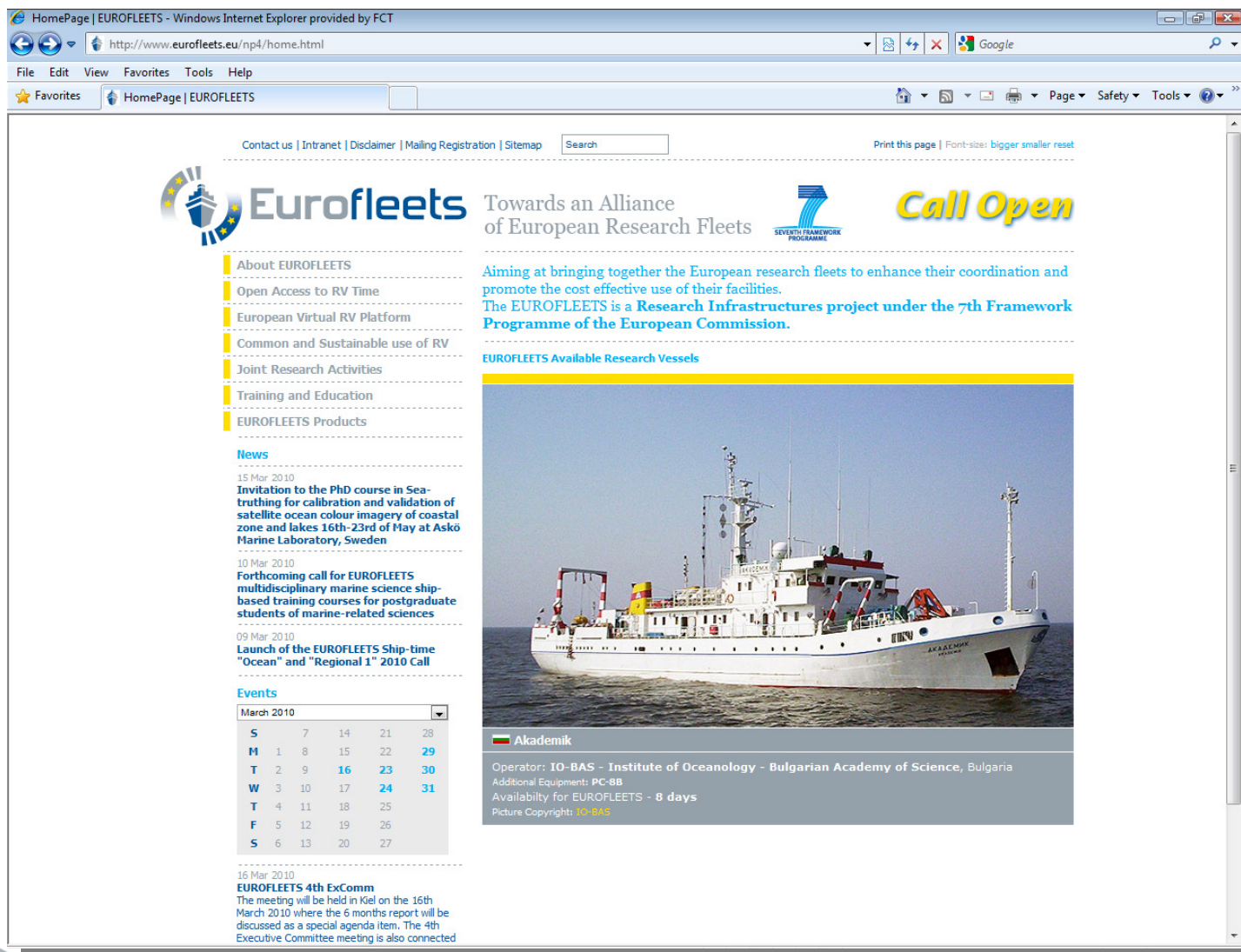
Figure 1 – EUROFLEETS “Internet Hub” Homepage